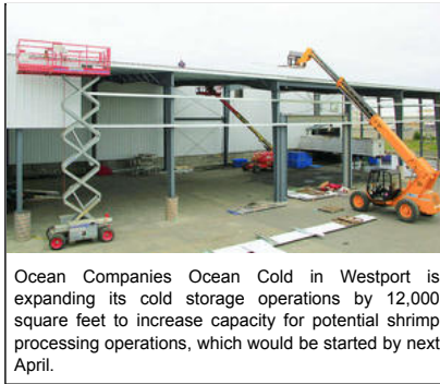
Ocean Companies Ocean Cold in Westport is expanding its cold storage operations by 12,000 square feet to increase capacity for potential shrimp processing operations, which would be started by next April.

By submitting this form, you accept the Mollom privacy policy.